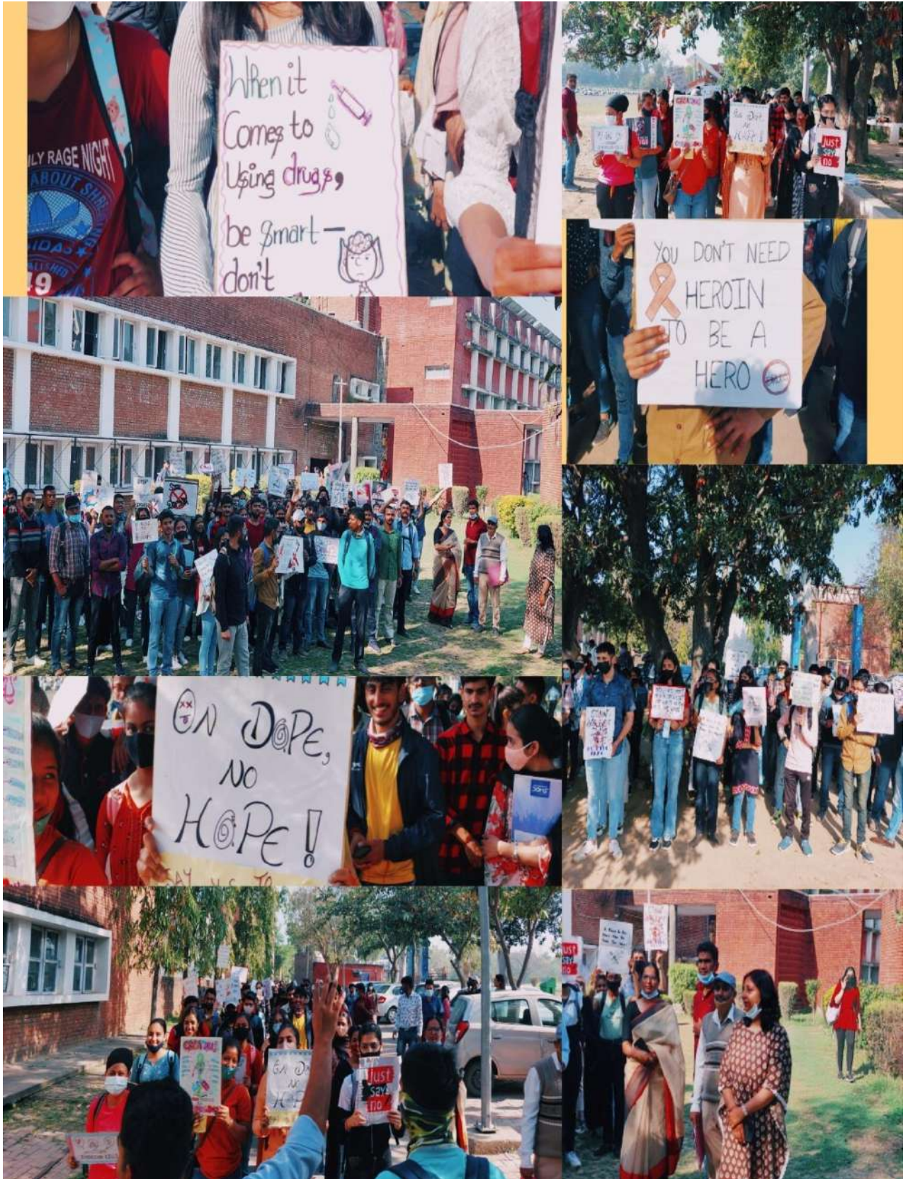
Anti Drug Awareness Campaign