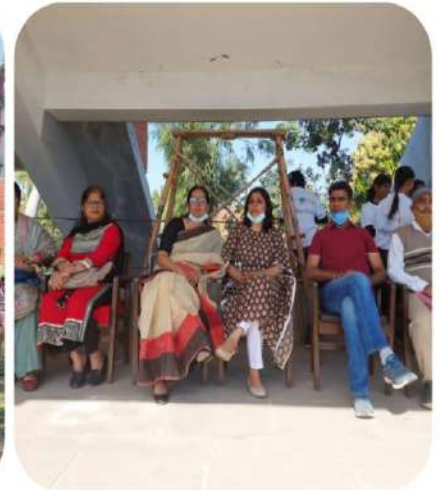
Anti Drug Awareness Campaign