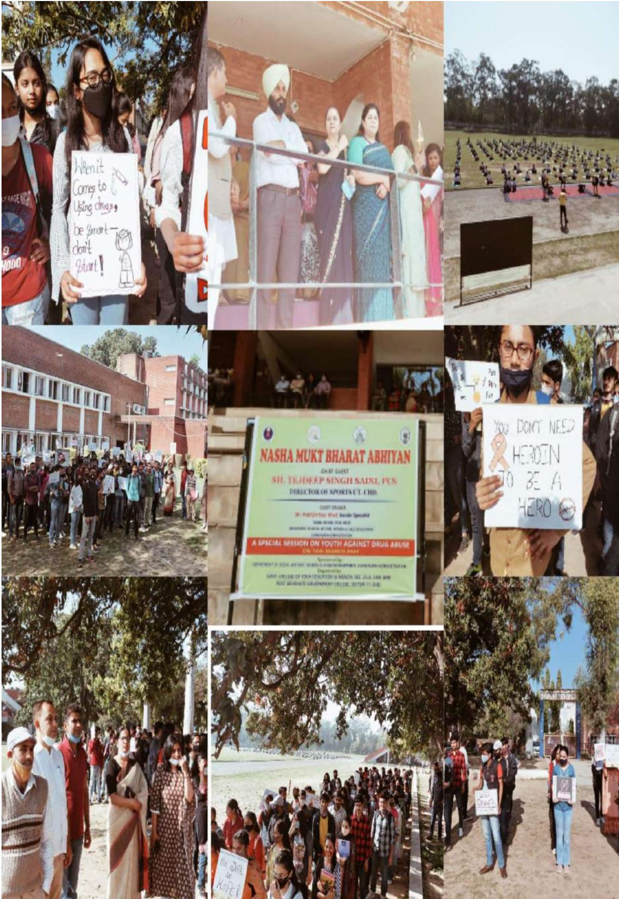
Anti Drug Awareness Campaign