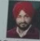
S. Charanjit Singh Channi Hon'ble Minister Emp. Gen. & Training, Govt. of Punjab