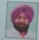
Capt. Anwarul Haq Hon'ble Chief Minister Punjab